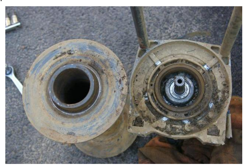
Figure 3. Motor and drum separated

7. Inside the drum will be a cone brake (if your winch has a drum brake – more expensive winches have the brake in the gearbox). Typically this will be stuck inside the drum, the picture below shows mine, note the dog ears that match up with the cup on the end of the motor that you have just removed.