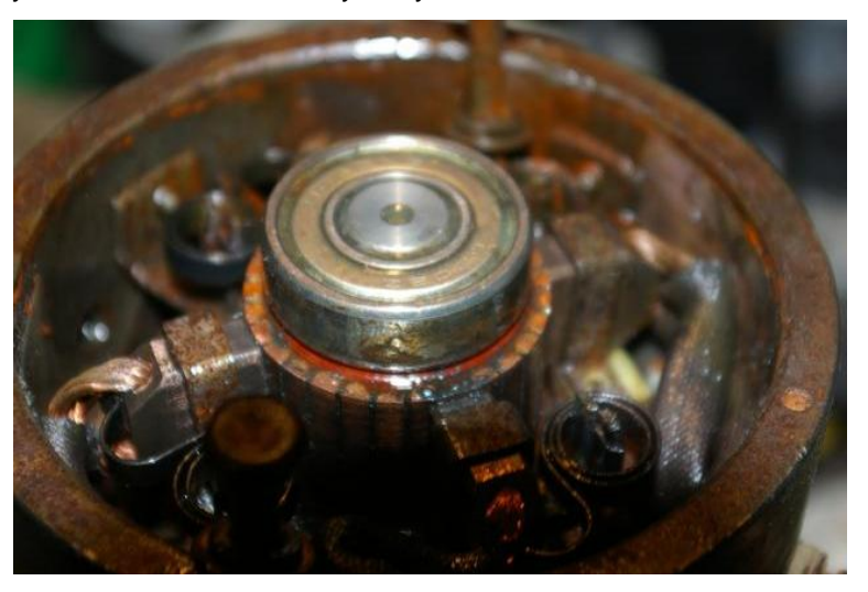
Figure 24. Motor assembly completed

29. Once the brushes are working the motor can be re-assembled. You have to hold the brushes back otherwise they foul the commutator as you try and re-assemble it