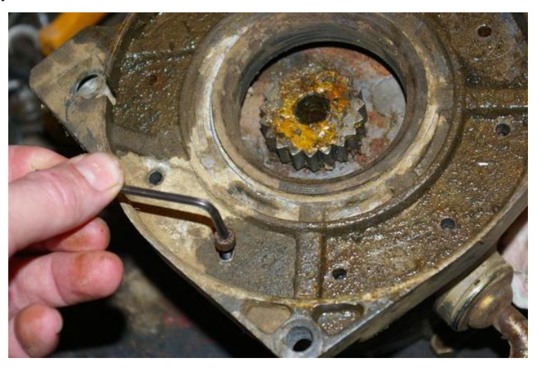
Figure 7. Removing the end plate

10. Now its time to tackle the gearbox. The gearbox will be held to the drum end plate by some small screws, in my case these are hex socket headed bolts.