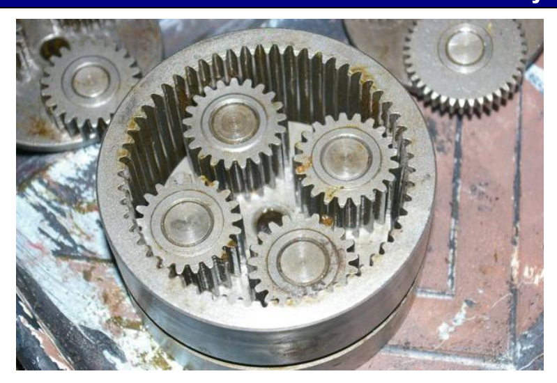
Figure 19. Clutch ring in position