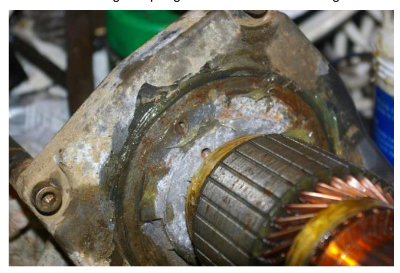
Figure 22. Greasing the frame/casing joint

28. At one end of the motor sits the brushes. These are spring mounted so that they can move as they wear. It looks as if they are not replaceable on my motor but there is an element of maintenance that you can do anyway. Check that each brush moves freely in its mount. Mine were rusted up and not able to move. I gently eased them into moving using WD40 and 3in1.