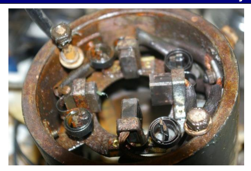
Figure 23. Motor brushes (see how the stuck ones have not sprung forward in their mounts)

29. Once the brushes are working the motor can be re-assembled. You have to hold the brushes back otherwise they foul the commutator as you try and re-assemble it