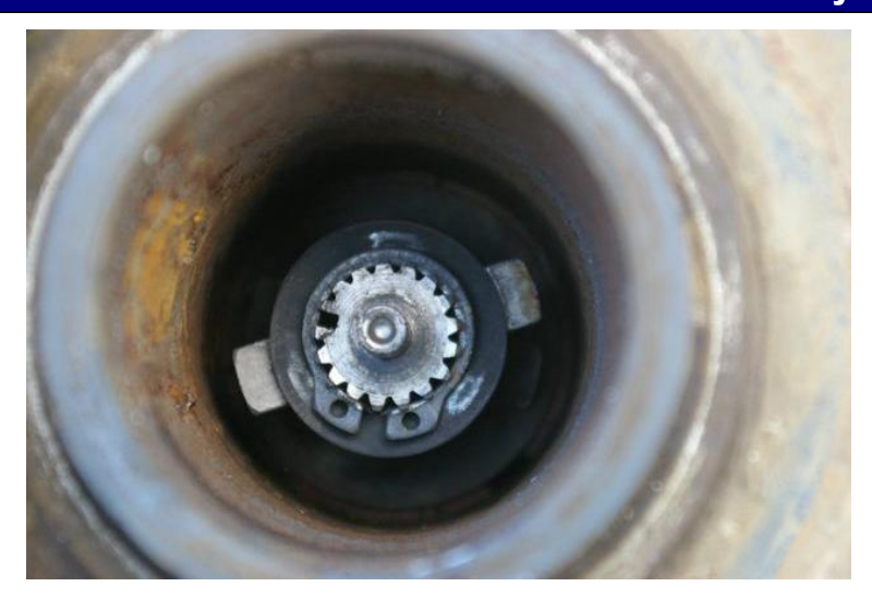
Figure 4. Drum Brake stuck in drum

8. You will need to gently drive the brake mechanism out if it is stuck. The picture below shows my brake once it is removed (note you can usually only drive it out in one direction but helpfully I cannot remember which direction that is! – there is a step machined inside the drum to stop it going the other way)