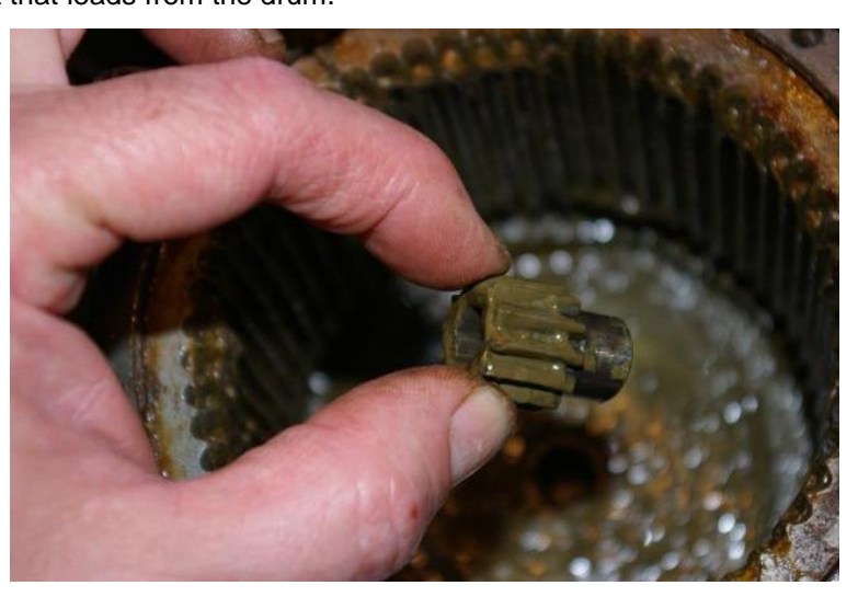
Figure 16. Small drive gear at bottom of gearbox

15. The final layer also has a small loose gear that sits at the very bottom and takes in the drive from the hex shaft that leads from the drum.