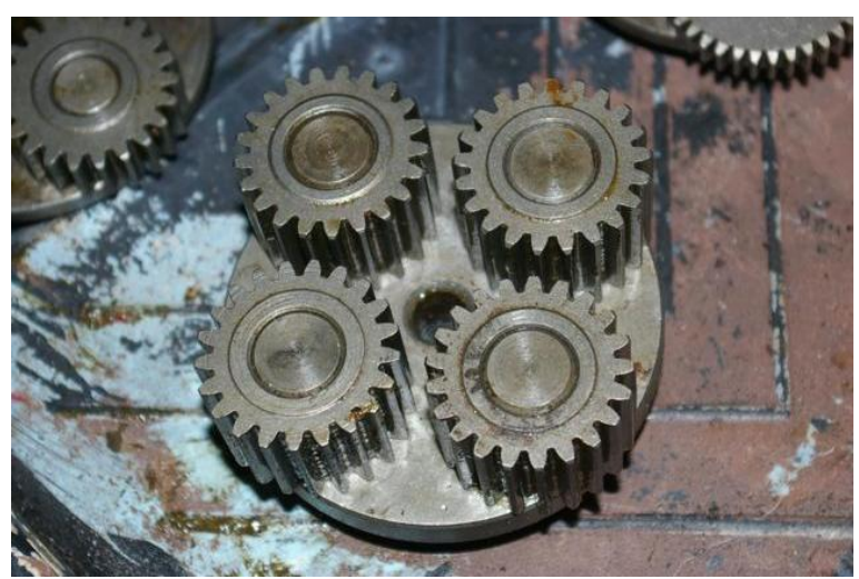
Figure 18. Output gears

20. The ring is placed upside down (the groove in the clutch ring is to the bottom) over the output gearset.