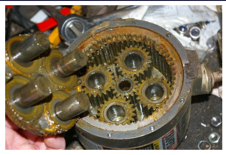
Figure 11. Layer 1 with the 4 heavy duty gears