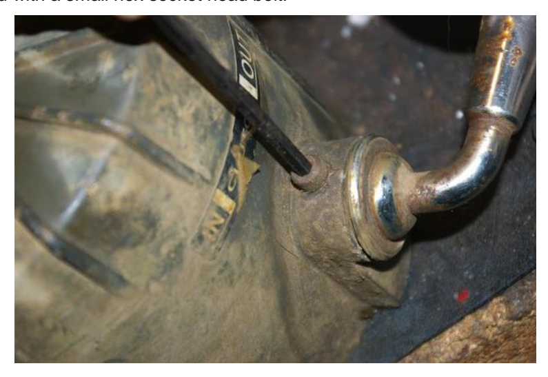
Figure 9. Removing the clutch lever

12. The gear box consists of layers of epicyclic gears built inside the clutch ring. The clutch ring slides and locks the outer edge of the gears forcing them to do their work. Each layer needs to be lifted out and cleaned. First release the clutch ring by removing the clutch lever from the casing. Mine was secured with a small hex socket head bolt.