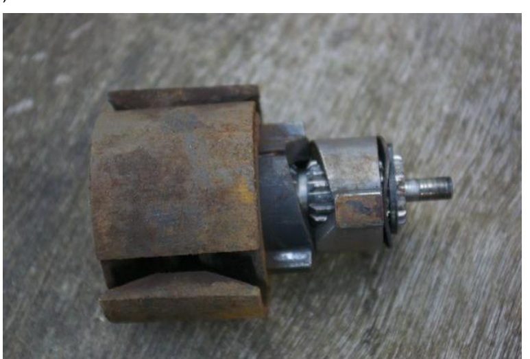
Figure 5. Cone Brake

8. You will need to gently drive the brake mechanism out if it is stuck. The picture below shows my brake once it is removed (note you can usually only drive it out in one direction but helpfully I cannot remember which direction that is! – there is a step machined inside the drum to stop it going the other way)