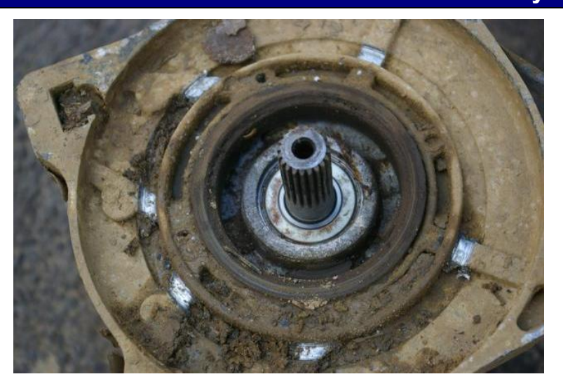
Figure 21. Motor showing bolt fouling marks