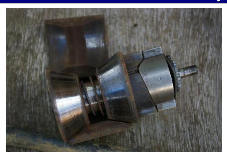
Figure 6. Cone brake parts

10. Now its time to tackle the gearbox. The gearbox will be held to the drum end plate by some small screws, in my case these are hex socket headed bolts.