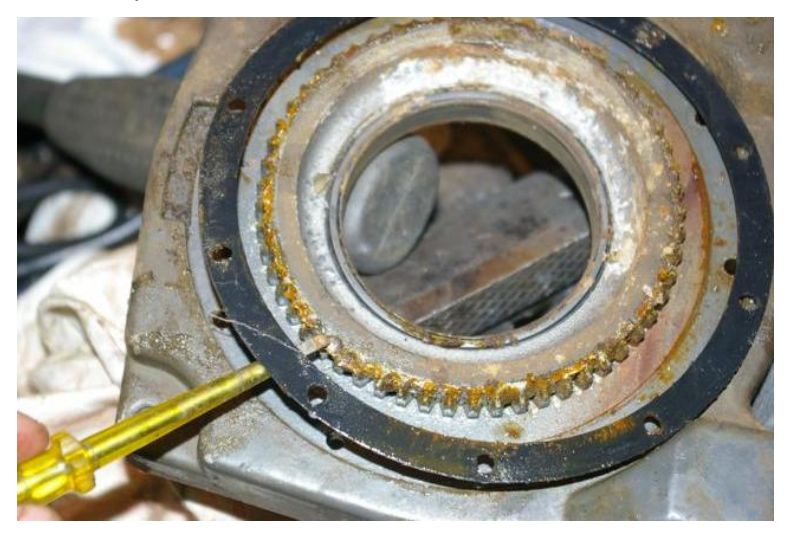
Figure 8. Gearbox case seal

11. On the back of the end plate is a seal which should not be lost!