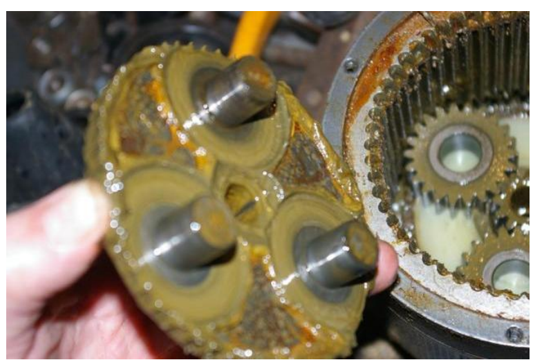
Figure 13. Layer 2 and the plate with "pegs"