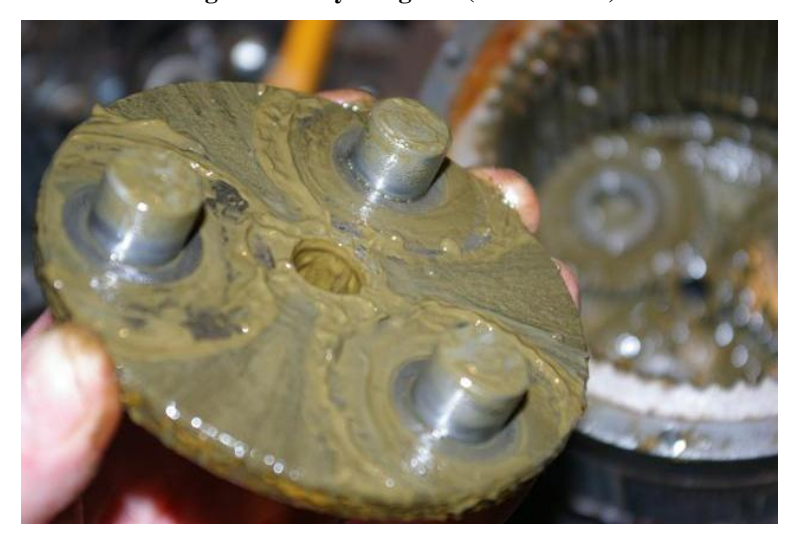
Figure 15. Layer three plate

15. The final layer also has a small loose gear that sits at the very bottom and takes in the drive from the hex shaft that leads from the drum.